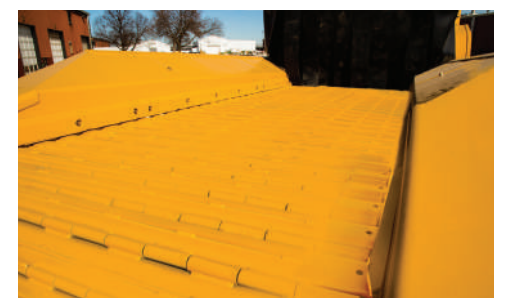
CONVENIENT FEEDING. The HG6800TX features low side walls to aid in feeding whole trees and other larger material with less restriction, reducing the number of user interactions with the material.