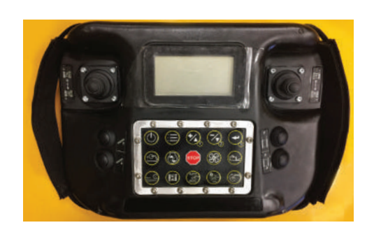
CONVENIENT CONTROL. The transceiver remote is equipped with a fault log, machine control menu, and the ability to supply the user with machine-operating information to monitor the machine's health.