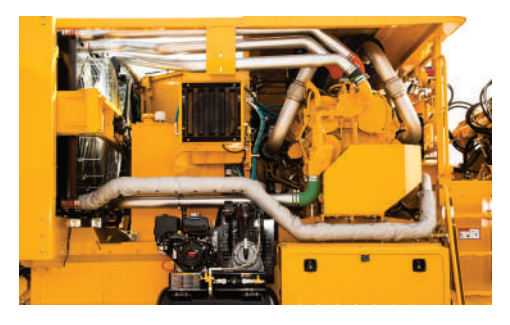
ENGINE HORSEPOWER. The dynamic combination of a high-horsepower engine on a machine boasting a compact design, results in a versatile horizontal grinder with high production.