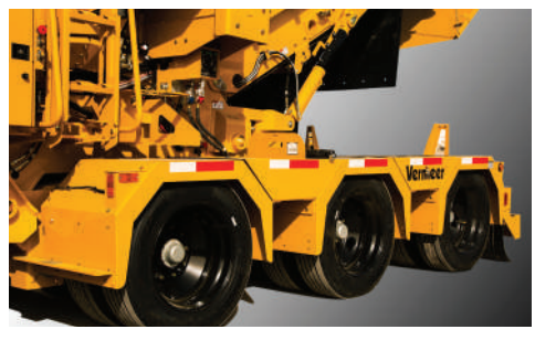
MOBILITY. The DT6 optional integrated dolly transport system eliminates the need for a dedicated trailer to move between sites.